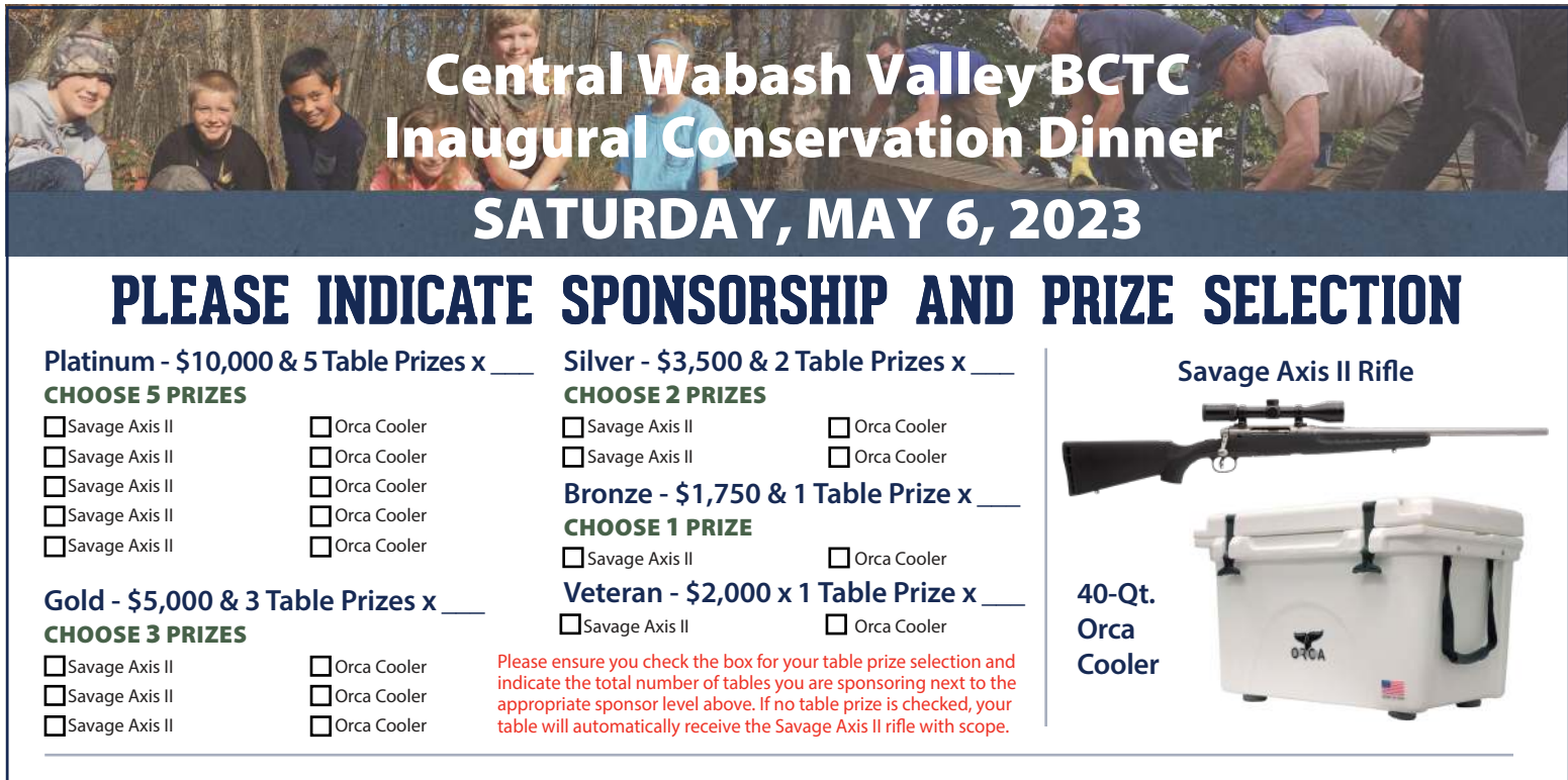
TABLE SPONSOR CONTACT: