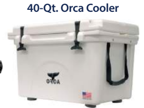
40-Qt. Orca Cooler