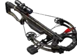
Barnett Whitetail Hunter STR Crossbow