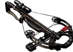
Barnett Whitetail Hunter STR Crossbow