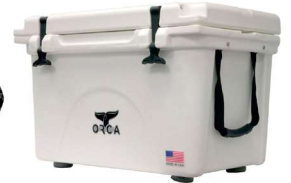
40-Qt. Orca Cooler