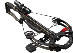
Barnett Whitetail Hunter STR Crossbow