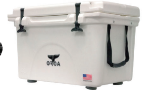
40-Qt. Orca Cooler