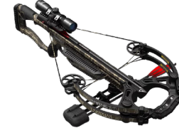
Barnett Whitetail Hunter STR Crossbow