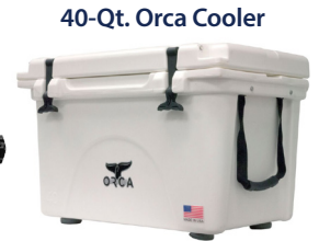
40-Qt. Orca Cooler