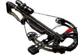
Barnett Whitetail Hunter STR Crossbow