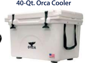
40-Qt. Orca Cooler