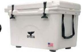
40-Qt. Orca Cooler