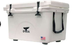
40-Qt. Orca Cooler