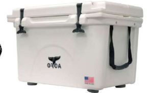
40-Qt. Orca Cooler